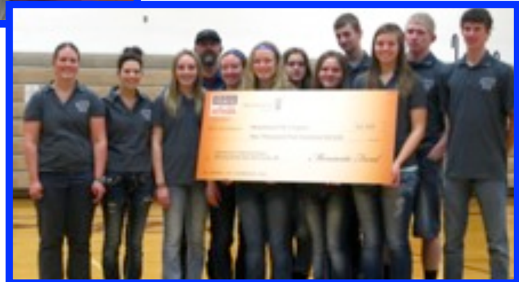
FFA Chapter receiving the Monsanto check.