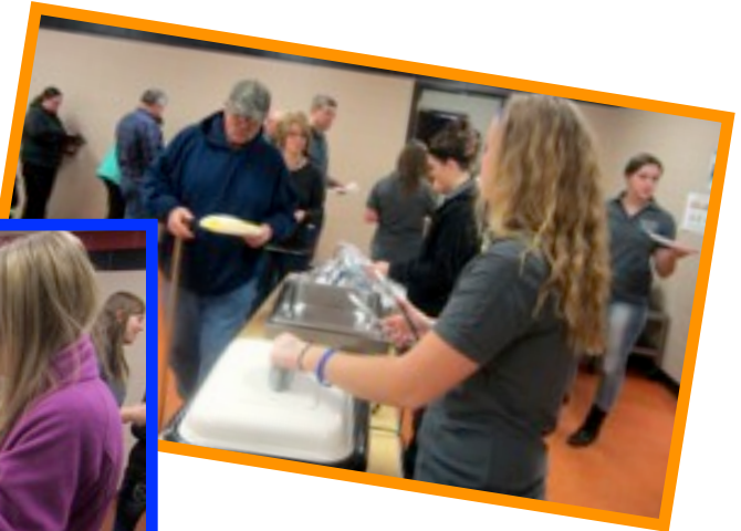
FFA Members preparing and serving the pancake supper.