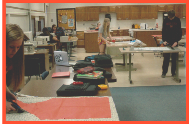
8th Grade students cutting out their aprons.

The high school FCS class recently visited the preschool class for observations as part of their child care unit and prepared muffin treats for all the students.