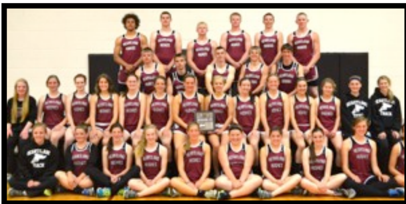
The Heartland girls finished second and the boys finished third at the district track meet.