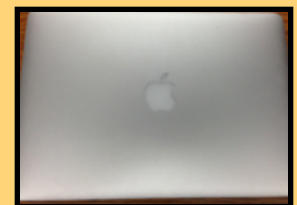
MacBook Air Laptop