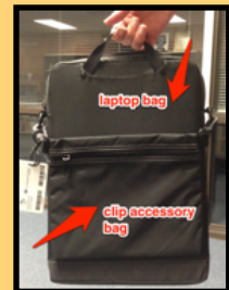
Laptop Bag with Clip Accessory Bag