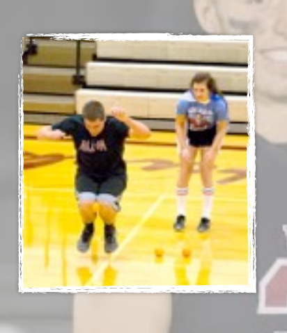
King & Queen