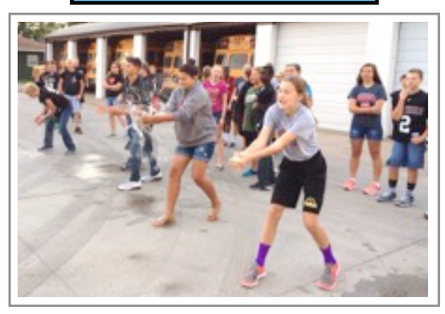
Junior High Chooses Homeroom Names

Junior high students have been busy in homeroom so far this year. They have chosen their homeroom name from the theme Board Games. They selected Life, Trouble, Monopoly and Battleship. They have been earning Huskie Bucks for their homerooms by competing in challenges. Soon we will begin reading the book <u>Kid President's Guide to Being Awesome</u> and working on their Thriller competition dance.