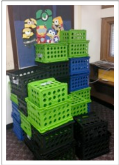
New totes were purchased to replace the old recycling boxes.