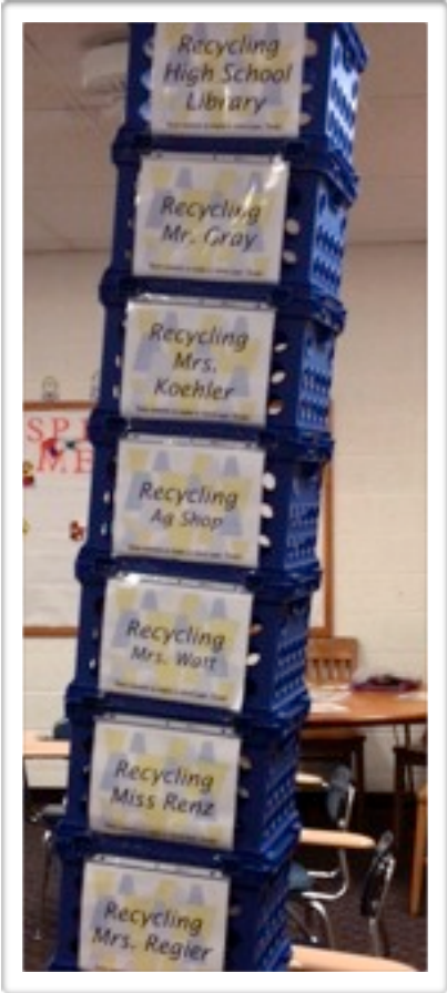
Recycling totes for the classrooms